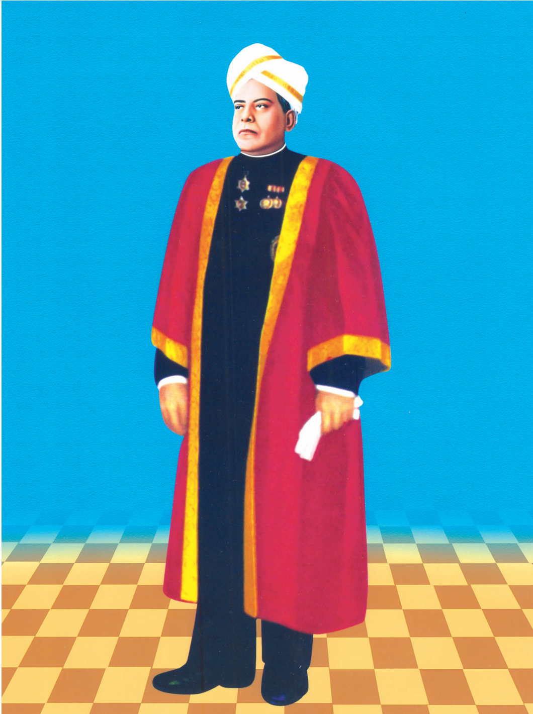
Dr. Rajah Sir ANNAMALAI CHETTIAR OF CHETTINAD, Kt., LL.D., D.Litt. Founder Pro-Chancellor