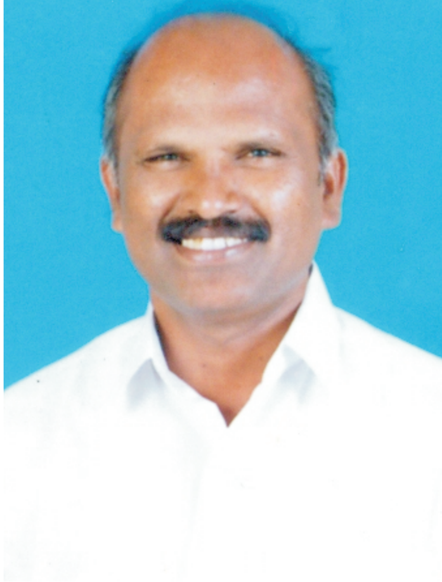
Thiru P. Palaniappan Hon'ble Minister for Higher Education, Govt. of Tamil Nadu and Pro-Chancellor of the University