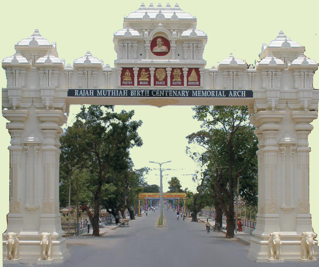
Rajah Muthiah Birth Centenary Memorial Arch