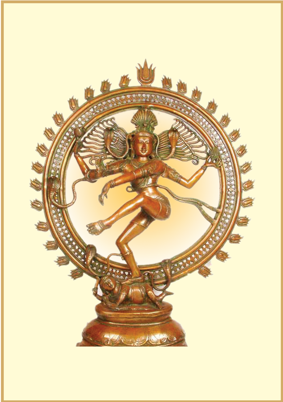
LORD NATARAJA, THE COSMIC DANCER