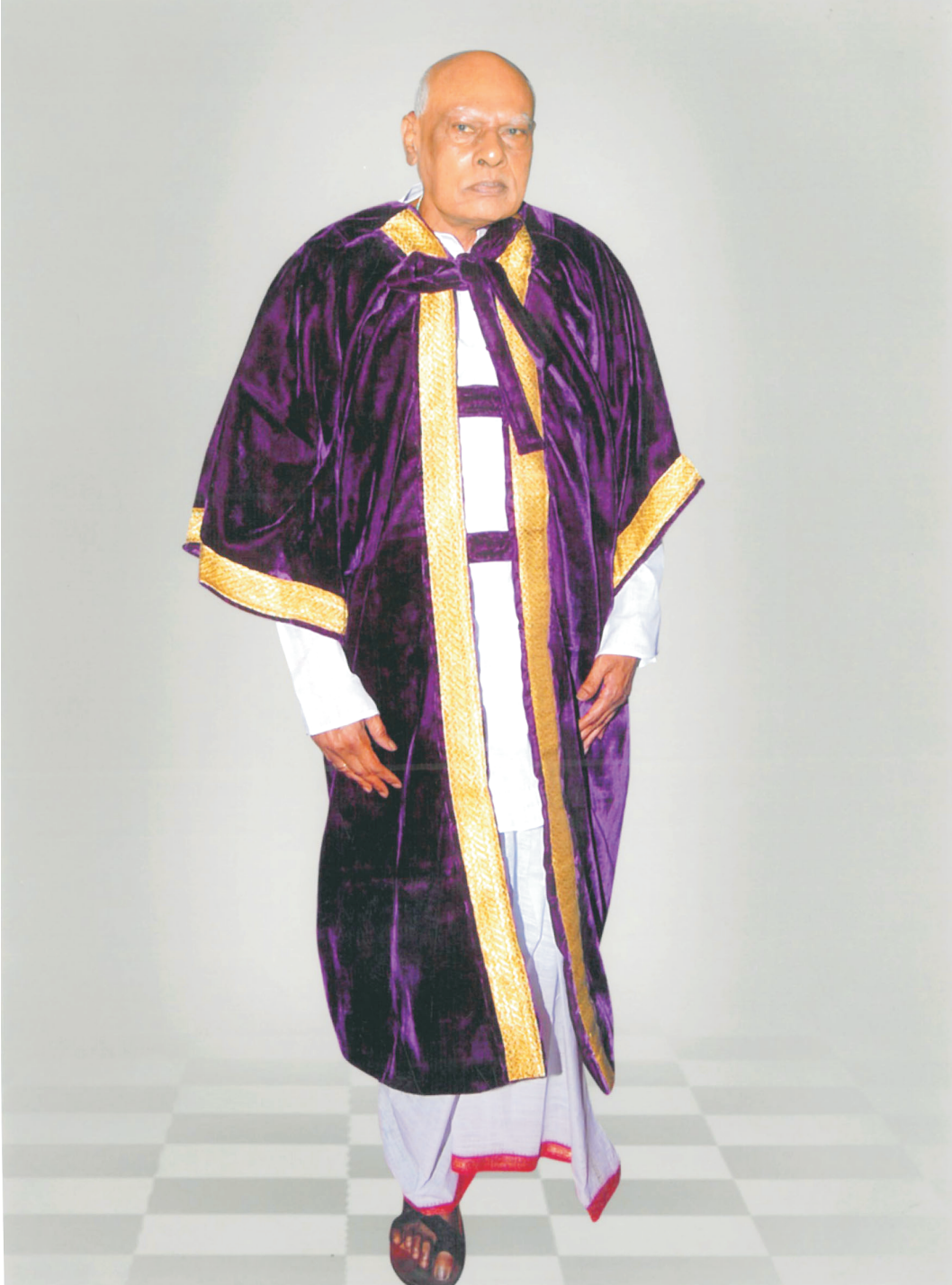
His Excellency Dr. K. ROSAIAH Governor of Tamil Nadu and Chancellor of the University