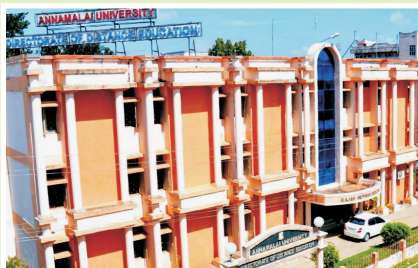
Directorate of Distance Education