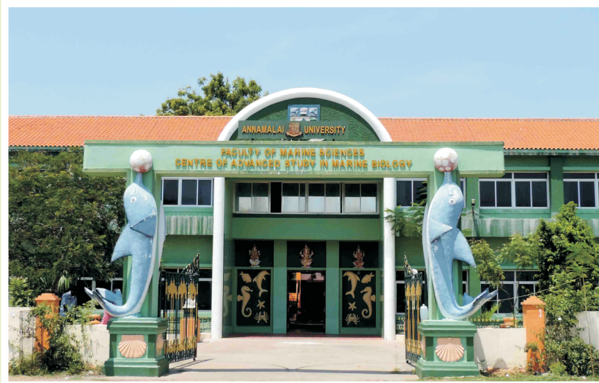
Faculty of Marine Sciences